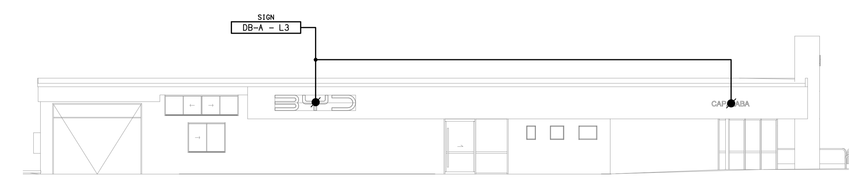
SMITH STREET EXTERNAL BUILDING ELEVATION SCALE 1:100

ELECTRICAL DESIGN GROUP BRISBANE PTY LTD ACN 092 710 793 TRADING AS: ELECTRICAL DESIGN GROUP